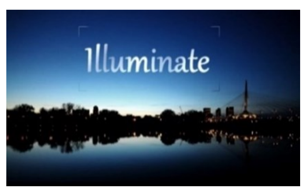
"Illuminate" Evening of Adoration of the Blessed Sacrament – December 13, 2024

Evening of Adoration of the Blessed Sacrament – All are invited to participate in a dynamic evening of adoration, praise & worship, reconciliation and fellowship on Friday, December 13 at 7:30pm, at St. Emile Parish. 556 St.Anne's Rd. Come and worship Jesus in the Blessed Sacrament as part of a vibrant Catholic community. All are welcome! For more information, <a href="https://www.illuminatemb.com">www.illuminatemb.com</a> or <a href="mailto:facebook.com/illuminatemb">facebook.com/illuminatemb</a>. Illuminate is an evening of Eucharistic Adoration, Praise & Worship music, and fellowship, with the opportunity to take part in the sacrament of Reconciliation. See you there!